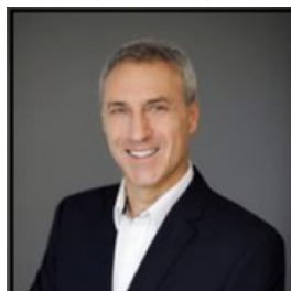
Managing Director Based in Brisbane